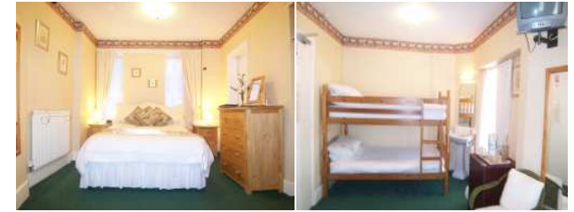
Standard Double/Family Room

Each room is centrally heated, has Freeview TV; a hairdryer; complimentary hospitality tray; quality toiletries, hand and bath towels. Superior rooms also have fridges and bath sheets.