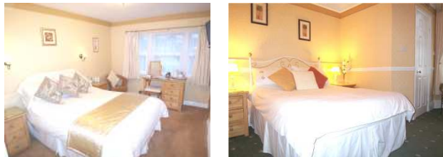
Superior Double Rooms

All rooms are en-suite, spacious and light and have been tastefully decorated and refurbished to a high standard.