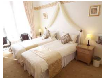
Superior Twin/Double Room

The Baytree has six well appointed comfortable guest bed rooms with two superior bedrooms on the ground floor and four bedrooms on the first floor which consist of two standard and a further two superior guest bedrooms.